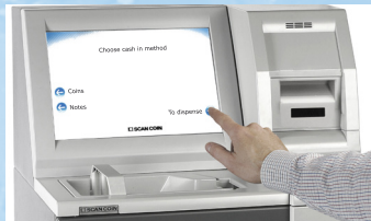
Touch screen for flexible and user friendly interface.