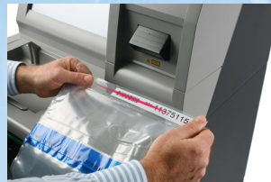
A barcode scanner is used to identify and register bags, envelopes, coupons, et c.