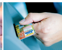
Choose between different card readers (option).